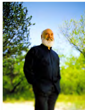
Dr. Andrew Weil